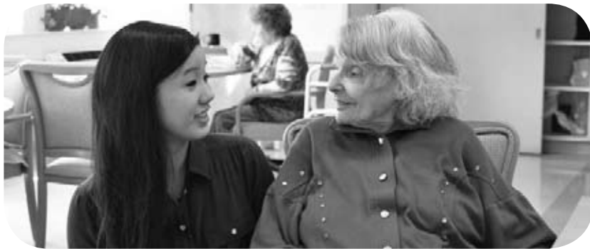
PBHA's Harvard College Alzheimer's Buddies

Act on a Dream strives to motivate college students nationwide to become actively involved in immigration reform. Act on a Dream focuses in part on providing immigrant students equal educational opportunities by means of lobbying, educating the public, and raising awareness within campus communities and throughout the nation. Act on a Dream club strives to grant thousands of hardworking students access to higher education and eventual citizenship while promoting political activism among the nation's youth.