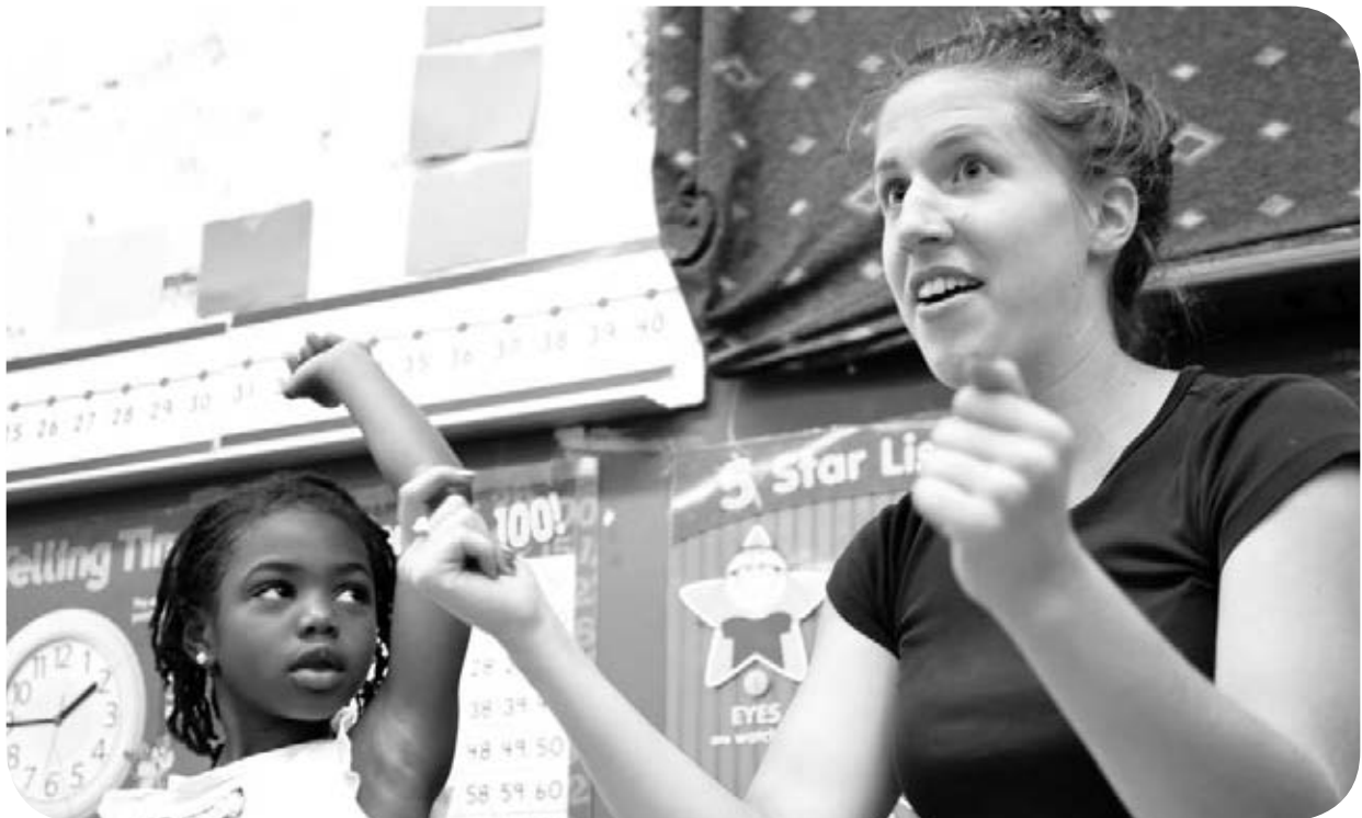
Cambridge Youth Enrichment Program (CYEP)

Summer Science is an amazing opportunity to teach kids in the camps PBHA runs each summer. Teachers, with full support of the Summer Science team and various resources like the Science Museum, help develop original lessons and lab experiences for each of the seven weeks the camps run. For a 30 hour per week commitment, benefits include great staff friendships, extensive workshops on creative curriculum development, and training for teaching skills.