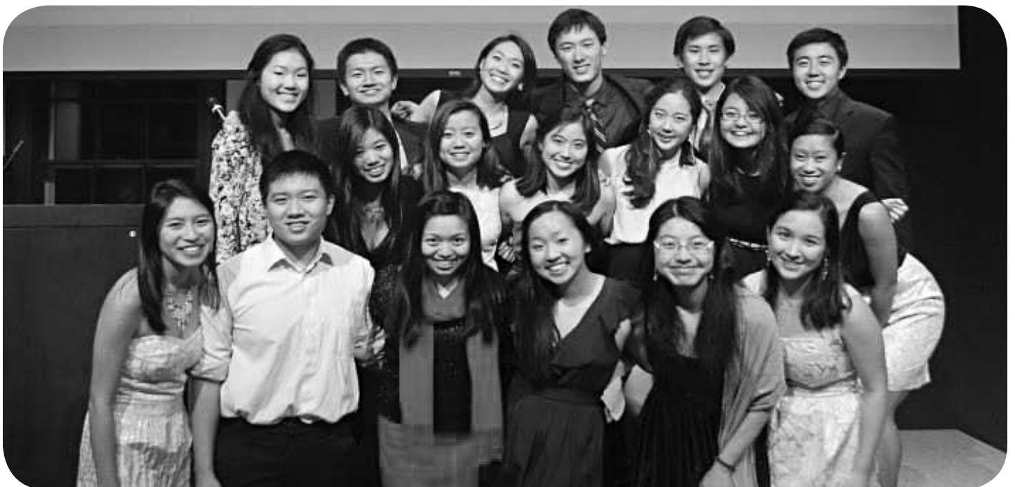
Harvard China Care