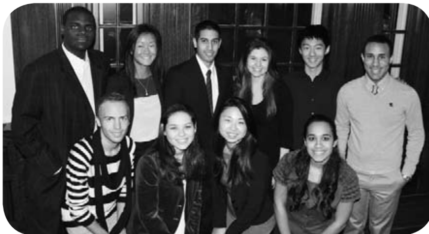
PBHA's Harvard Undergraduate Legal Committee

PBHA's Harvard College Youth Leadership Institute (HYLI) offers a leadership development program to middle school students from Cambridge public and charter schools. HYLI focuses on teaching the students essential leadership skills using hands-on, experiential learning techniques. The program takes place on campus once per week and a variety of student groups serve as classroom guests throughout the semester.