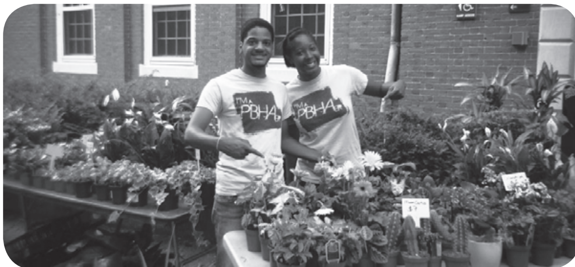
PBHA's Annual Plant Sale

The Institute of Politics offers grants of up to approximately $2,000 to support the participation of Harvard students in activities that promote political awareness and involvement around the campus community. See http://www.iop.harvard.edu/student-group-grants .