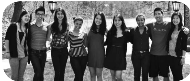
PBHA's Chinatown Afterschool Program

PBHA's Chinatown Afterschool seeks to promote academic enrichment and build self-esteem and intellectual curiosity for children of low-income families in Boston's Chinatown community in a safe and supportive afterschool environment through tutoring, educational projects, and literacy activities. It runs Mondays through Thursdays from 3:45 to 5:45 at the Chinese Consolidated Benevolent Association building in Chinatown, and the program is conducted entirely in English.