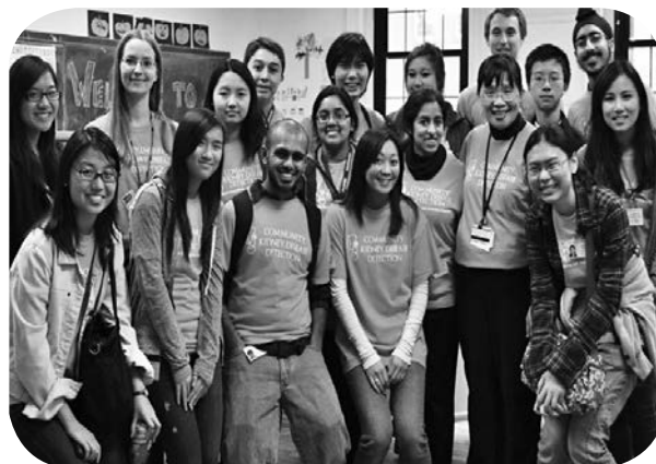
Kidney Disease Screening and Awareness Program

KDSAP provides free screenings and community-based health education to underserved Asian American, African American, and Hispanic communities. Every month, KDSAP volunteers participate in a clinical health screening led by one of Boston's leading nephrologists at a local community center, church or school site. In addition to interacting closely with patients, volunteers provide basic health education, work with nephrologists, and gain experience in running a nonprofit. Medical experience is not necessary.