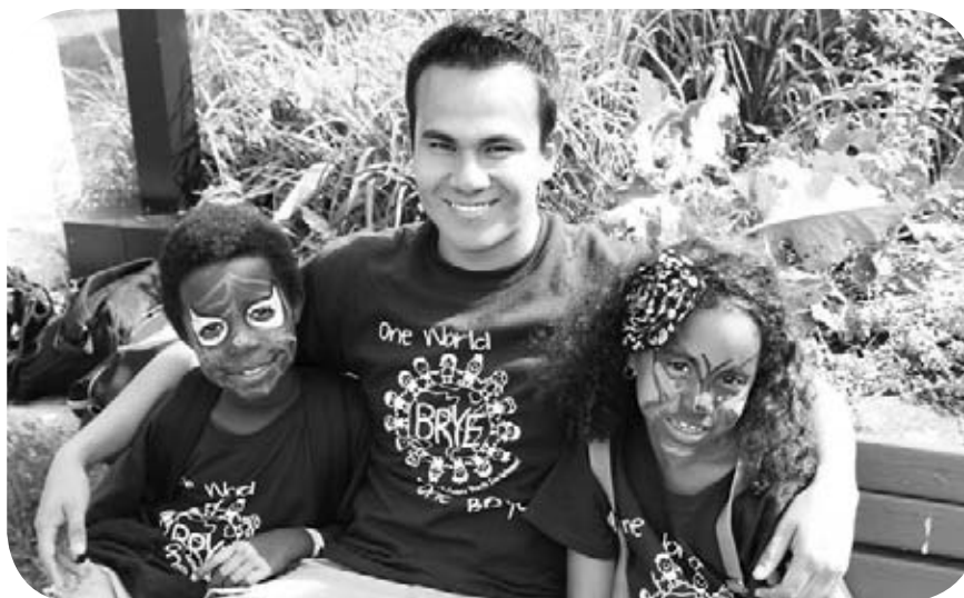
SUP Midsummer Celebration

PBHA's Summer Urban Program (SUP) is one of the most remarkable and intensive student-run service experiences available to undergraduates, and it has had a profound impact on undergraduates and community youth alike. Serving over 830 youth ages 6-14, the summer programs run from July to August, Monday through Friday, from 8:30-4pm. Each day is broken up by mornings spent on curricular, classroom-based enrichment and afternoons of field trips in and around Boston. Each camp uses the city as a classroom without walls, with the summer culminating in talent shows and final trips. Community partnership is an essential element of SUP; often former campers are hired as Junior Counselors, and parents and community leaders play an important role in shaping and working with the program. Senior Counselors (SCs) receive a stipend of up to $3,600 (the stipend for RYSE SCs is slightly less), paid weekly over the entire summer. SCs also receive housing at Harvard or in the community where they work. The dates of the summer commitment are from early June through late August.