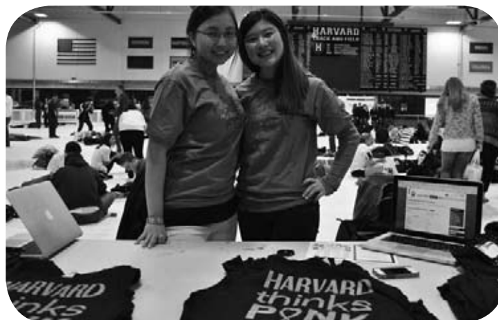
Harvard Cancer Society

The DREAM Program builds communities of families and college students that empower youth from affordable housing neighborhoods to recognize their options, make informed decisions, and achieve their dreams. DREAM is based locally in Cambridge, and seeks volunteers who can make a commitment to youth, meeting every week and participating in group activities.