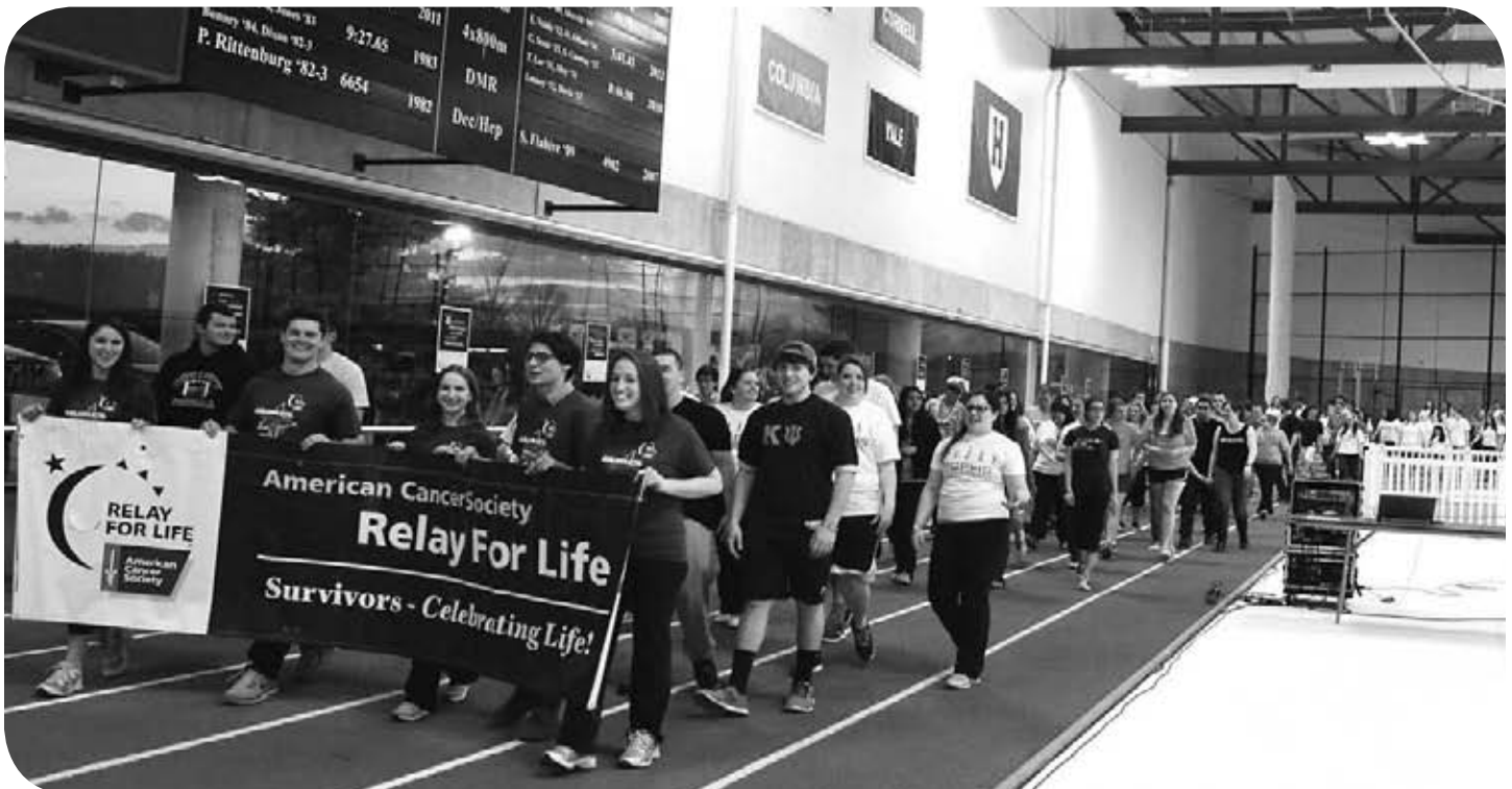
Harvard Cancer Society Relay For Life