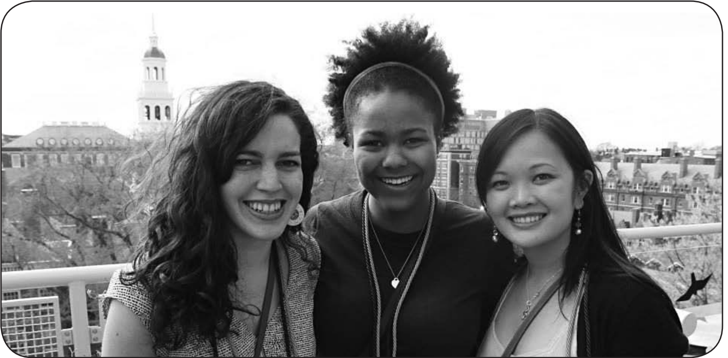
PBHA Officers at Annual Public Service Celebration