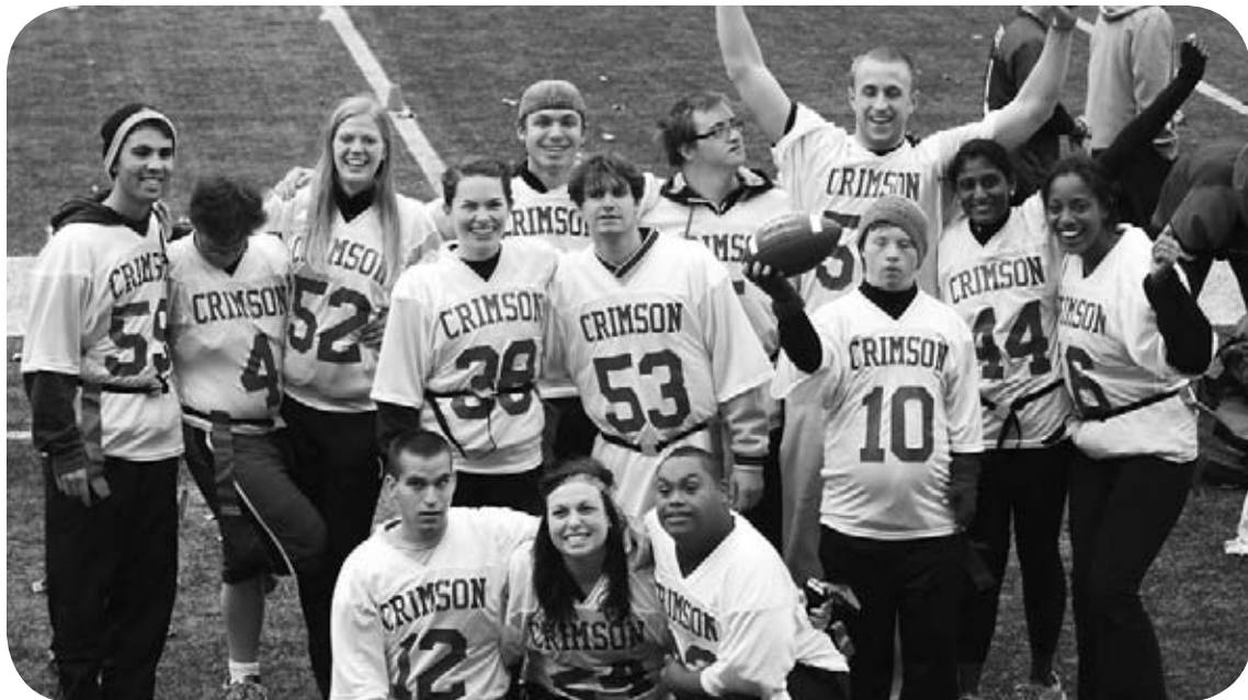
Harvard College Special Olympics