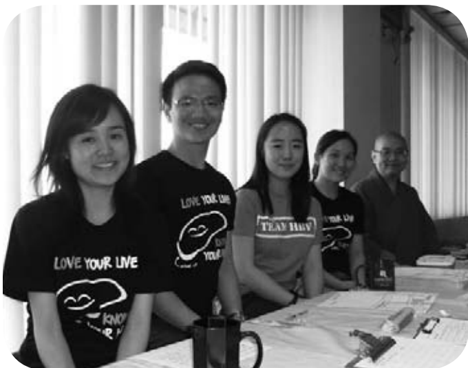
Team HBV at Harvard College

Team HBV at Harvard focuses on addressing the leading health disparity of the Asian and Pacific Islander population, hepatitis B, caused by the Hepatitis B Virus (HBV). We are part of a nationwide initiative to combat this completely preventable yet extremely prevalent disease. We organize educational presentations to vulnerable populations in Boston, hold campus outreach events, create and disseminate resources, educate youth, offer access to screenings and vaccinations, and strengthen political advocacy. We exercise creativity, communication skills, and analytical thinking as we effect real change for this disease.