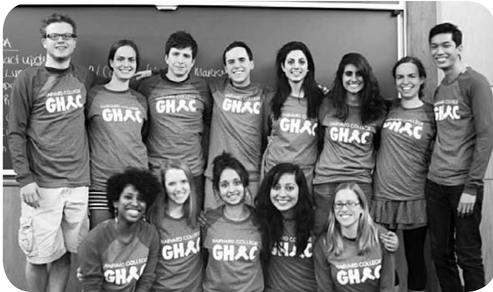
Harvard College Global Health and AIDS Coalition