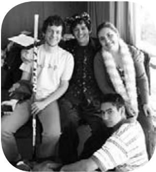
Harvard Story-Time Players