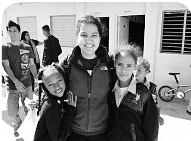
Harvard University Engineers Without Borders

HUEWB, affiliated with the national Engineers Without Borders, seeks to promote a global consciousness among students by working on environmentally sound and economically sustainable engineering projects. The projects usually last 3-5 years and culminate in a trip to the community in which they will be implemented. Members from a variety of concentrations are encouraged to join. HUEWB is dedicated to the EWB mission: "Building A Better World, One Community At A Time."