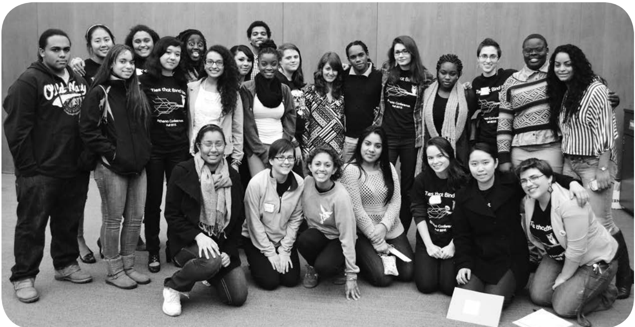
PBHA's Athena Program

PBHA's Athena program aims to unite students of all genders from underserved, low-income communities in the greater Boston and Cambridge areas with undergraduate mentors who support and challenge each other in discussion and skill building around gender empowerment, community leadership, and youth activism. Athena runs on Saturdays, and includes a yearlong mentoring program and a semi-annual conference, both focus on topics relating to women and gender issues.