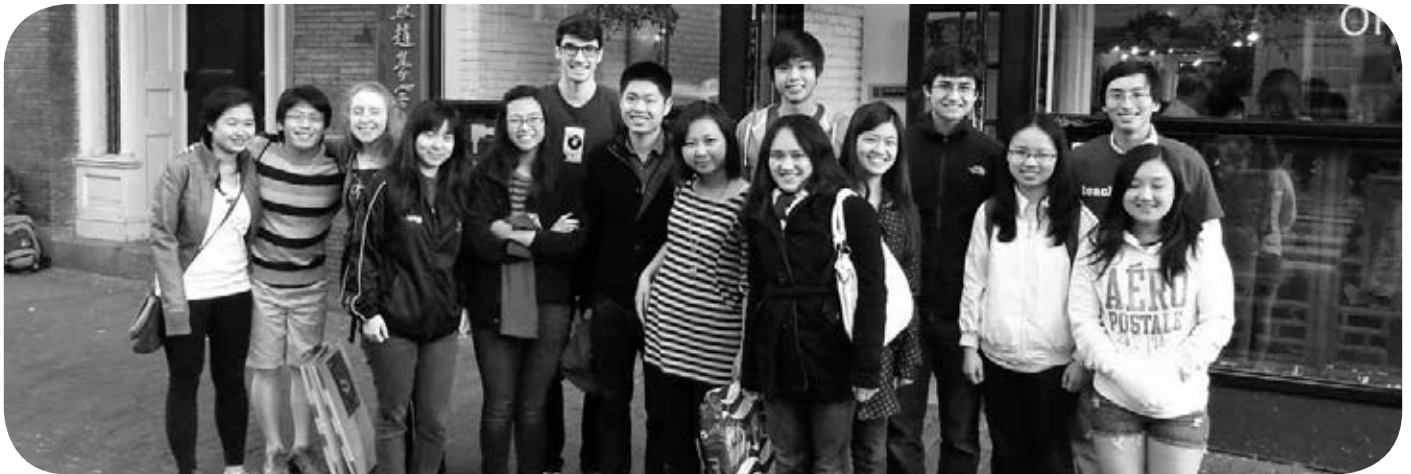
PBHA's Chinatown Citizenship Program

PBHA's Chinatown Citizenship is a naturalization assistance program that promotes social and political empowerment for Chinatown immigrants through supporting them in the naturalization process for U.S. Citizenship. Our free services include courses in U.S. history and government, mock interviews, translations, and sharing resources such as practice audio CDs. Our classes are held Saturdays and Sundays from 1:30 to 3:30 PM. The program's three terms are September-December, February-April, and June-August. During term-time, Chinatown Citizenship classes are held in Harvard's Vanserg Building.