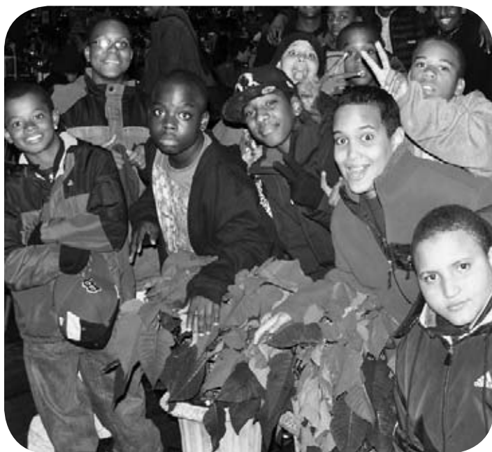
PBHA's David Walker Scholars Program