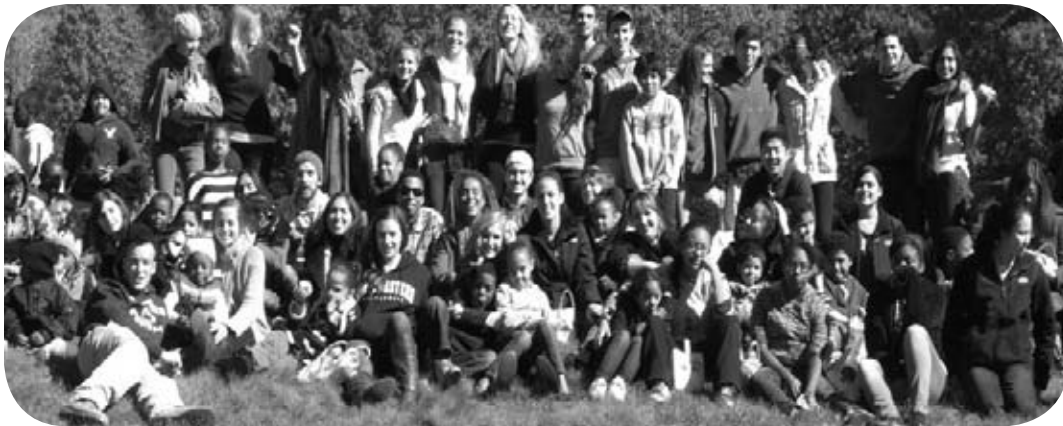
PBHA's Mission Hill Afterschool Program