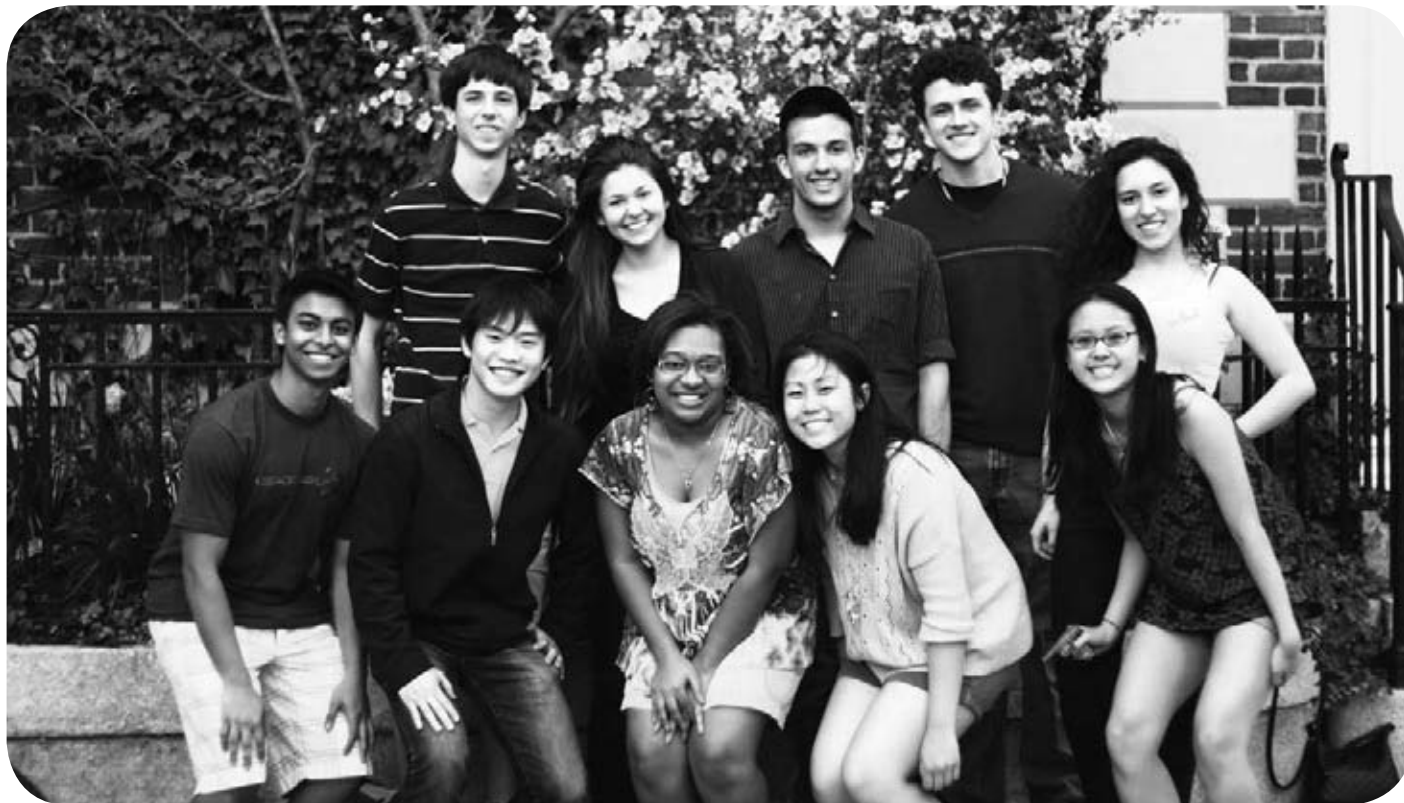
Harvard College Friends of the Red Cross