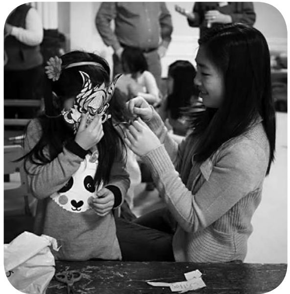
Harvard China Care

Advocating Success for Kids (ASK) Alberta V. Scott Leadership Academy (AVS) PBHA's Athena Program PBHA's Best Buddies PBHA's BRYE Teen PBHA's CHANCE PBHA's Chinatown Teen Program Digital Literacy Project Food Lab for Kids Friends of Project Sunshine Harvard College Coaches Harvard College Friends of Scouting Harvard Program for International Education (HPIE) Health Advocacy Program PBHA's Keylatch Mentoring PBHA's LEADERS! Mentors for Urban Debate PBHA's Mission Mentor PBHA's Peer Health Exchange (PHE) PBHA's Refugee Youth Term Enrichment (RYTE) Youth in Focus PBHA's Youth Prison Tutoring Program