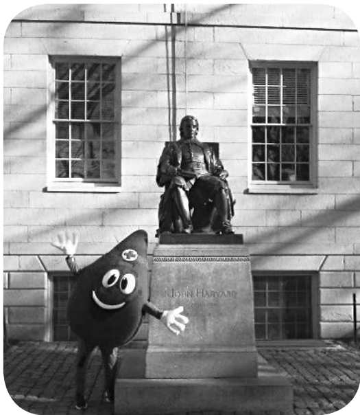
Harvard College Friends of the Red Cross