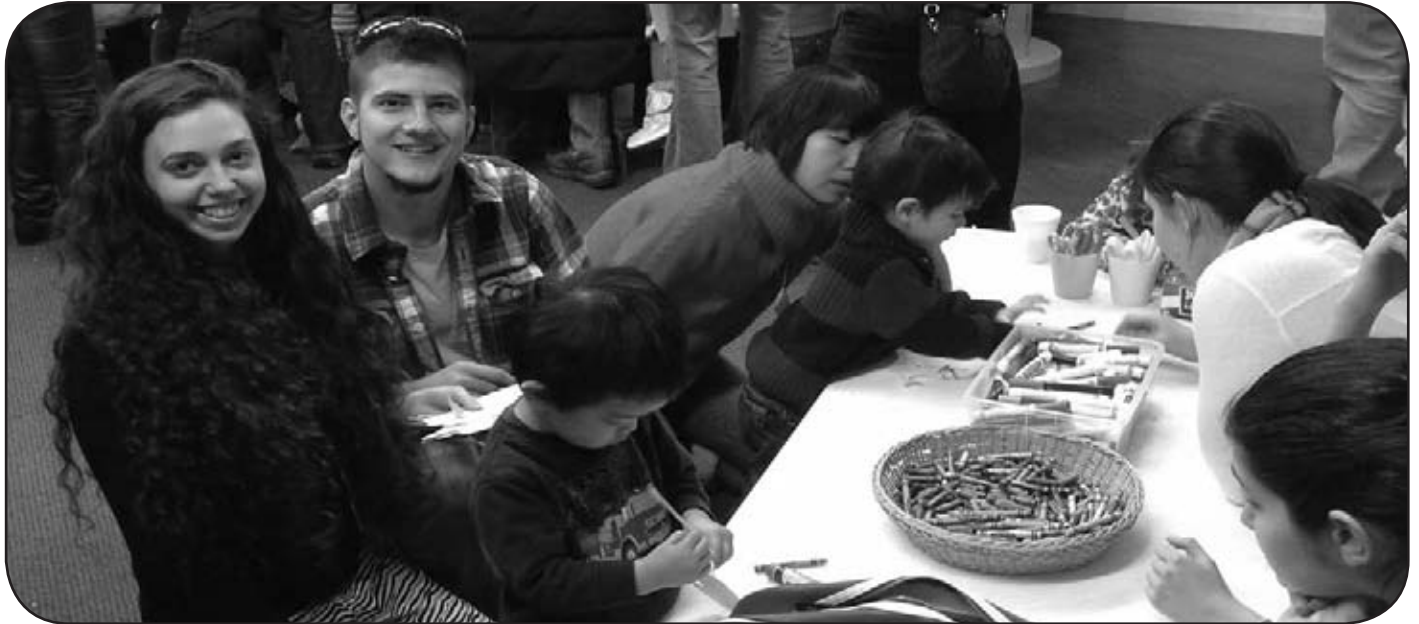
Harvard College Stories for Orphans