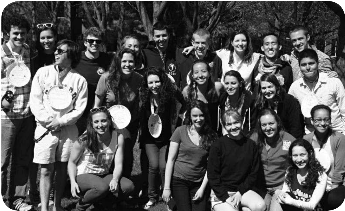
PBHA's Harvard Square Homeless Shelter