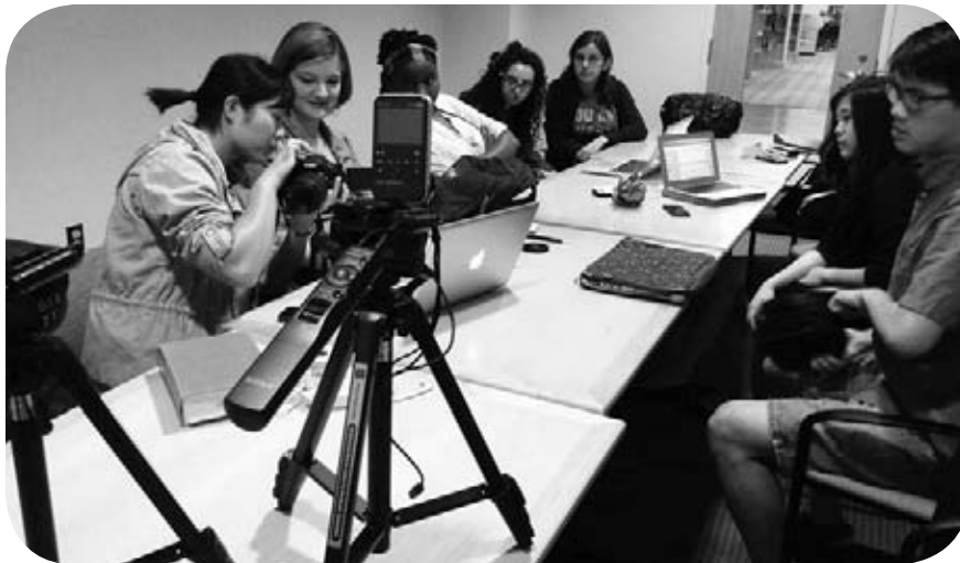
Harvard College Youth In Focus

Harvard Undergraduates Honoring Veterans (HUHV) strives to unite veterans, Harvard students, and community members in public service. HUHV works to achieve this goal by increasing student awareness of the importance of veterans, facilitating student involvement in organizations that help as well as challenge and engage veterans to contribute to the wellbeing of our society, creating a more veteran-friendly environment on campus by connecting veterans with undergraduates through the common goal of service, and hosting service projects throughout the year in Cambridge and Boston that bring together veterans and non-veterans alike. HUHV works year-round to help veterans continue in public service after their military careers have ended, as well as to increase undergraduate appreciation for what veterans have to offer as civic assets.