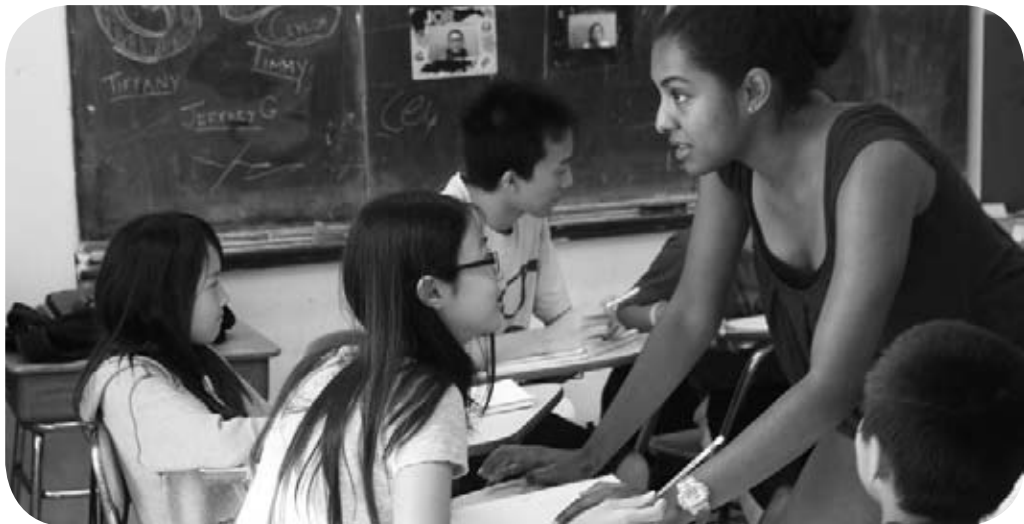
Chinatown Adventure (CHAD)

Chinatown Adventure (CHAD) seeks to enrich quality of life for underprivileged youth ages 6-13 in Chinatown. For seven weeks during the summer, each Senior Counselor collaborates with one or two Junior Counselors to mentor and teach a classroom of campers. Senior Counselors and Junior Counselors are encouraged to be creative and are expected to design their own curricula each week. All camp activities are designed to foster academic, social, and personal growth while promoting fun and safety at the same time!