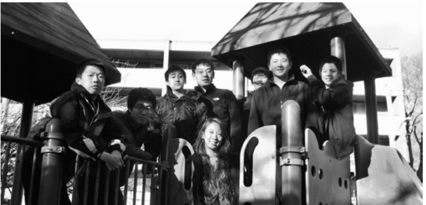
Chinatown Teen Program