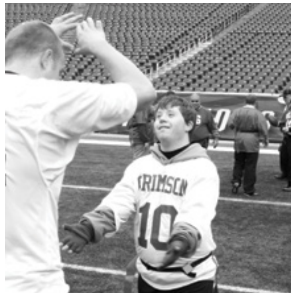
Harvard College Special Olympics

Harvard College Special Olympics aims to empower individuals with intellectual and physical disabilities by encouraging them to develop physical fitness, gain self-confidence, have fun, and form lasting relationships with other athletes and volunteers. Harvard College students connect with Cambridge-area community members to raise awareness and promote inclusion of individuals with disabilities. No prior experience with sports or individuals with disabilities is necessary to become a volunteer.