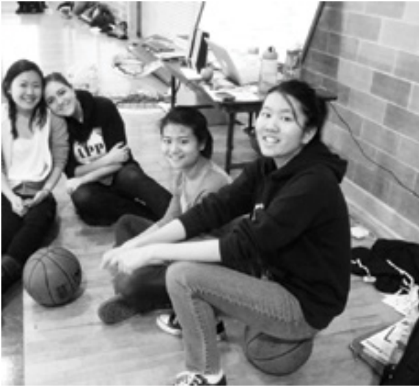
Harvard Cancer Society