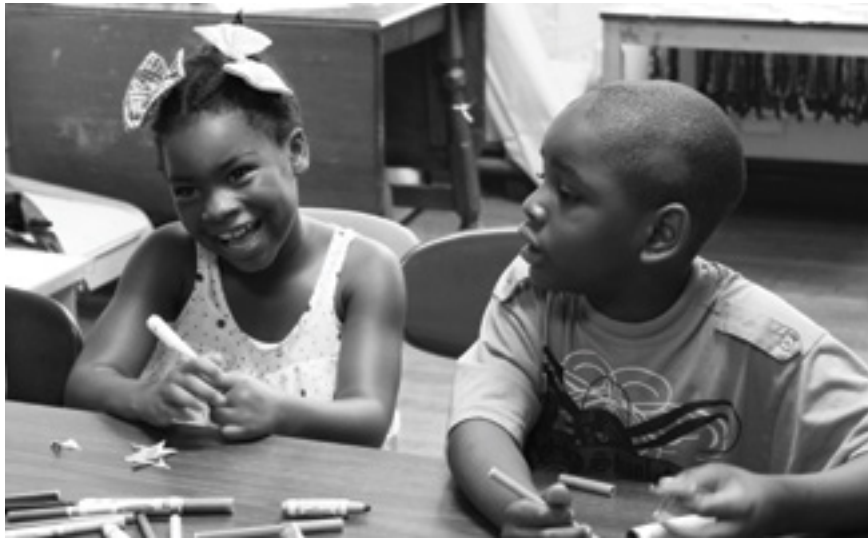
Franklin I-O Summer Program: Campers

The Summer Urban Program (SUP) is one of the most remarkable, intensive, student-run service experiences available to undergraduates, and it has had a profound impact on undergraduates and community youth alike. SUP is one of the most comprehensive summer camps available to low-income families in Boston and Cambridge. Each summer, approximately 100 college students live and work in various communities in Boston and Cambridge. Serving over 830 youth ages 6-14, the summer programs consist of mornings of curricular, classroom-based enrichment and afternoons of field trips in and around Boston. Each camp uses the city as a classroom without walls, with the summer culminating in talent shows and final trips. Community partnership is an essential element of SUP; often former campers are hired as Junior Counselors, and parents and community leaders play an important role in shaping and working with the program. Many camps have been operating for decades. Senior Counselors (SCs) receive a stipend of up to $3,600 (the stipend for RYSE SCs is slightly less), paid weekly over the entire summer. SCs also receive housing at Harvard or in the community where they work. The dates of the summer commitment are from early June through late August.