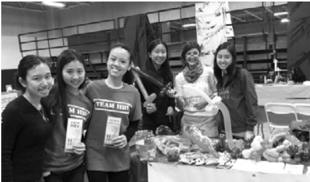
Team HBV at Harvard College

Team HBV's outreach efforts span both the community and the campus. It strives to raise awareness of hepatitis B, increase access to screenings and vaccinations, strengthen political advocacy, and promote the Jade Ribbon Campaign. In addition, it hopes to implement outreach initiatives and gain collective support from the community. Team HBV draws from a variety of perspectives in public health, preventive medicine, and health policy to effect real change with a specific focus.