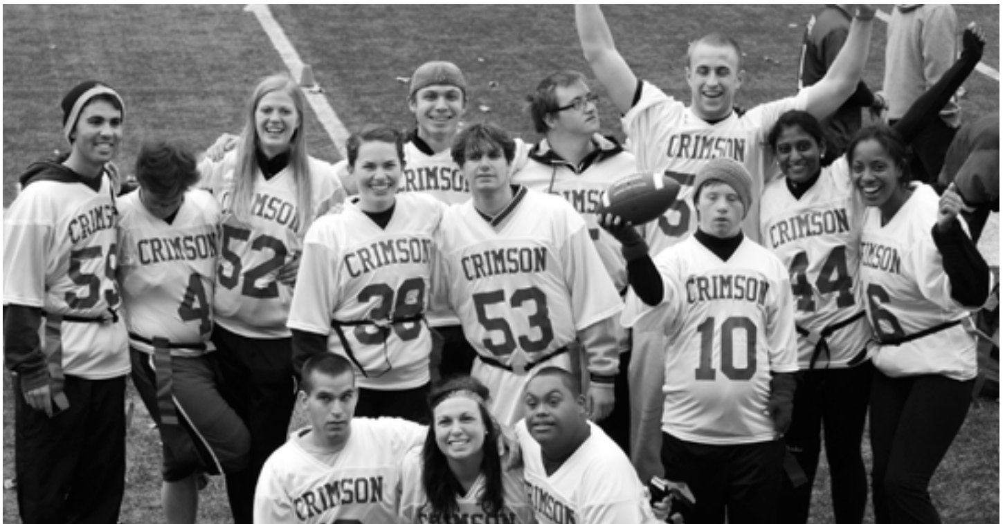
Harvard College Special Olympics