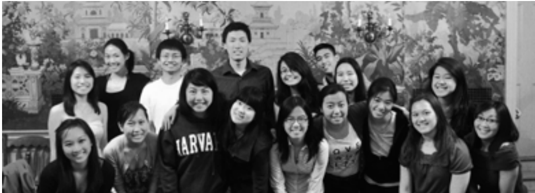
Harvard China Care

Harvard China Care (HCC), founded in 2003, was the first college branch of the national China Care organization. HCC brings together a dedicated group of students committed to improving the lives of orphans in China. HCC's work has already had a life-altering impact on thousands of children throughout China, raising almost $250,000 to date for orphan support. HCC's extensive summer internship program sends volunteers from Harvard to work at orphanages in Luoyang, Saiqi, Beijing, and Southern China. HCC's work not only takes place in China but also extends to the greater Boston community: HCC organizes a bi-weekly playgroup called "Dumplings" for adopted children from China and their families, and also coordinates a mentoring program to pair older adoptees with student mentors from Harvard. Both groups expose the children to Chinese culture while allowing them to interact with older role models. Whether you are looking to do direct public service with children in the U.S. or China, interested in issues of medical care, excited to travel to China, or want to tackle large-scale fundraising and event planning projects, HCC has something for you to do!