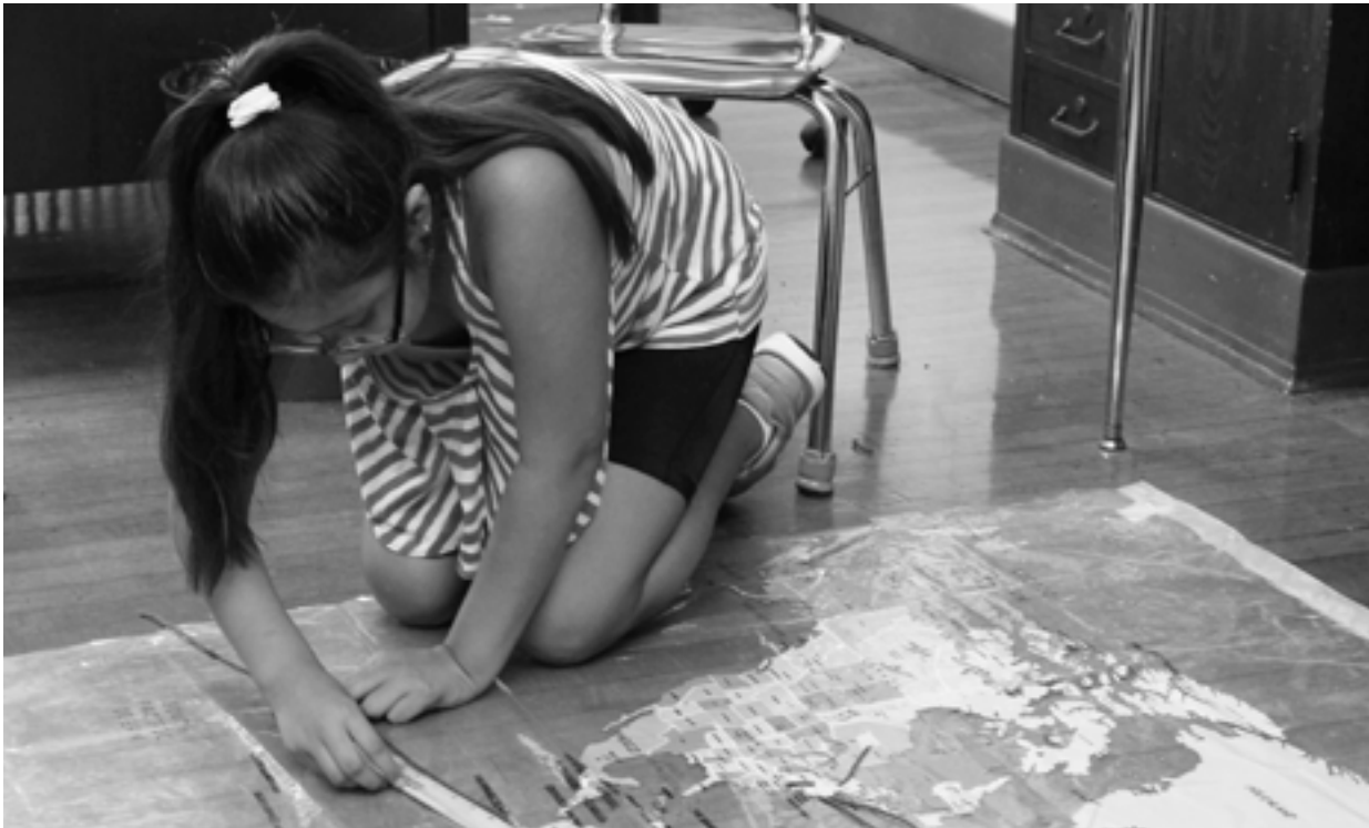
Summer Urban Program

Summer Science is an amazing opportunity to teach kids in the camps PBHA runs each summer. Teachers, with full support of the Summer Science team and various resources like the Science Museum, help develop original lessons and lab experiences for each of the seven weeks the camps run. For a 30 hour per week commitment, benefits include great staff friendships, extensive workshops on creative curriculum development, and training for teaching skills.