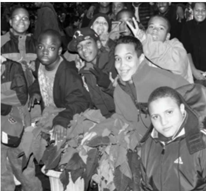
David Walker Scholars Program