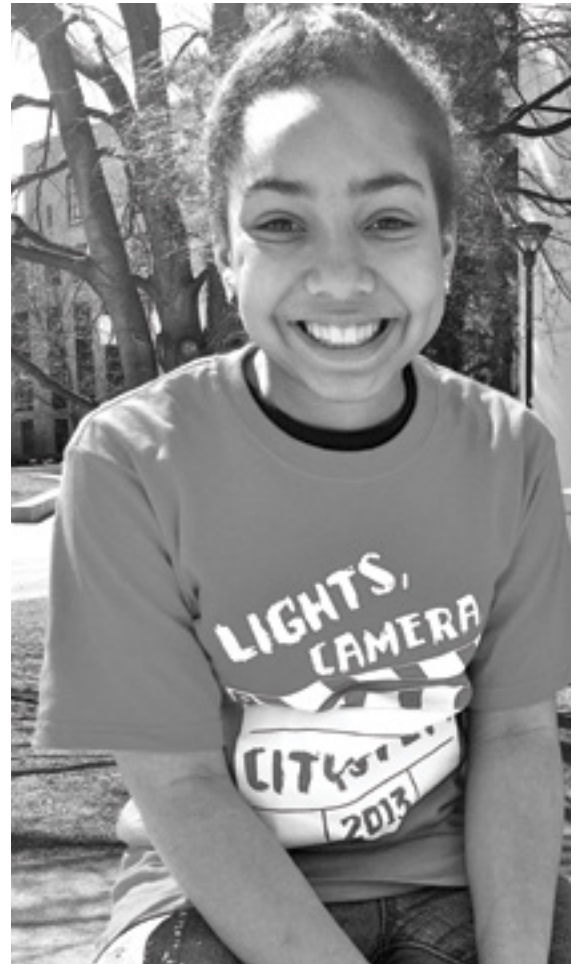
City Step Volunteer

The Summer Work-Study Program, administered by CPIC and the Student Employment Office, enables FWSP-eligible students to receive pay for summer volunteer work at community agencies.