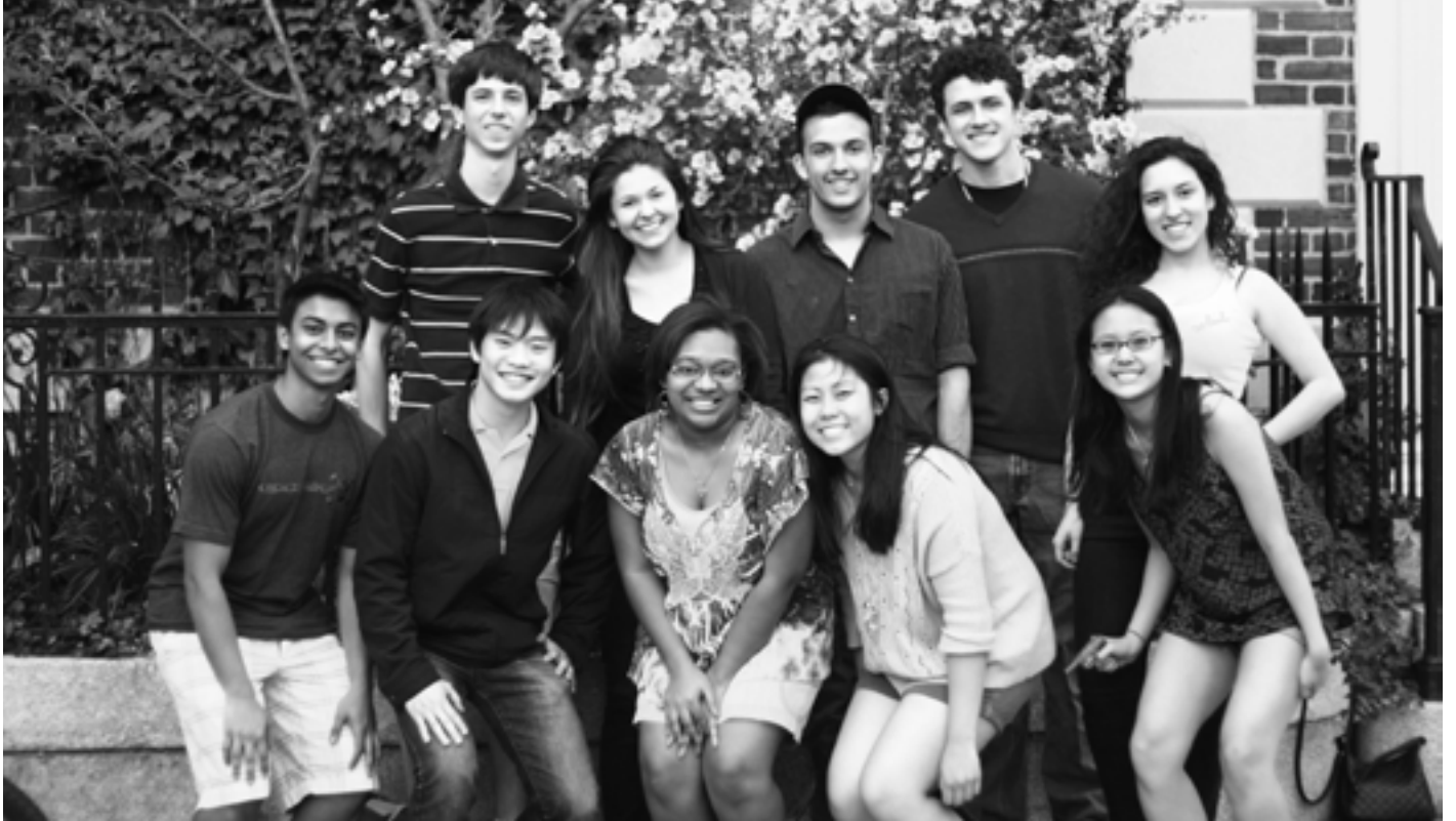
Harvard College Friends of the Red Cross