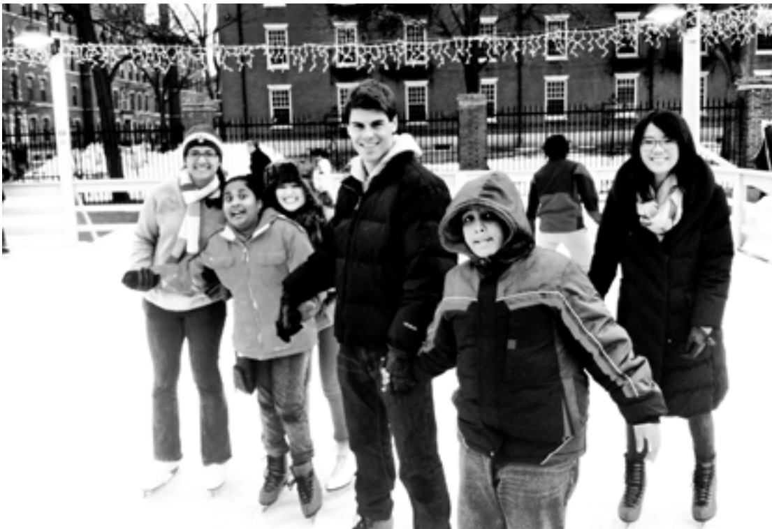
Marshall Afterschool Enrichment Program

Harvard College UNICEF's efforts will focus on increasing local awareness about UNICEF's mission both on campus and in the community. Harvard UNICEF aims to 1) educate members on the state of the health and education of the world's children 2) raise funds to be used towards UNICEF's work with these children, and 3) provide opportunities for members to directly advocate to protect the lives of children in need.