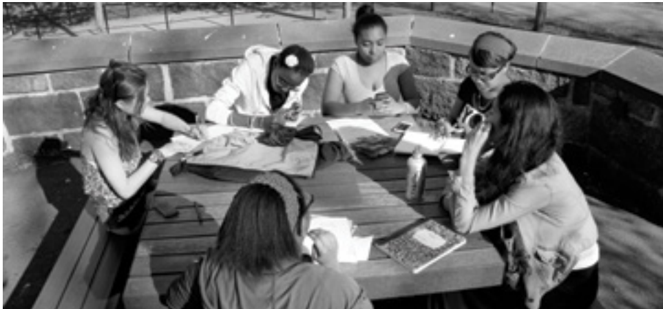
Mission Hill Afterschool Program