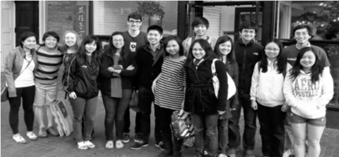
Chinatown Citizenship Program