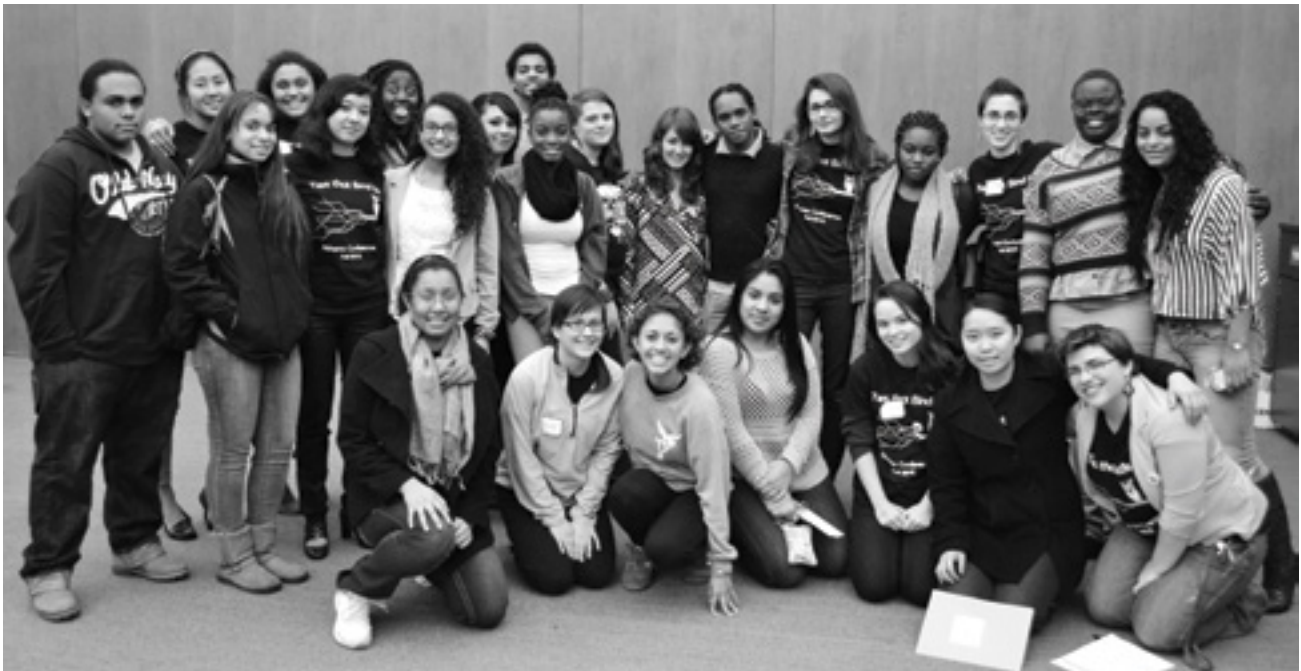
PBHA's Athena Program

Alternative Spring Breaks (ASB) runs public service trips during Spring Break. ASB travels to rural and urban areas throughout the eastern United States. ASB workz closely with community organizations to renovate homes, churches, community centers, and playgrounds and to learn about the social, economic, and political issues affecting the region. There is also time for fun activities like bowling, skating, and visiting national parks. With a motto of “community service, cultural exchange, and fun,” ASB provides a worthwhile experience during spring or winter break.