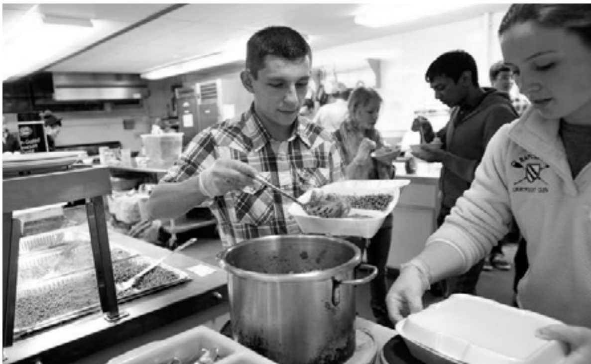
Harvard Square Homeless Shelter

Harvard-Radcliffe MIHNUET (Music in Hospitals and Nursing Homes Using Entertainment as Therapy) visits local hospitals and nursing homes twice per week in order to perform music and connect with the elderly and the ill. Musicians of all levels are welcome to join! MIHNUET also has an a cappella group, the Crimson Crooners, that performs weekly and is open to all interested members. Time commitment is as much or as little as you would like; MIHNUET welcomes you anywhere from once per semester to twice per week!