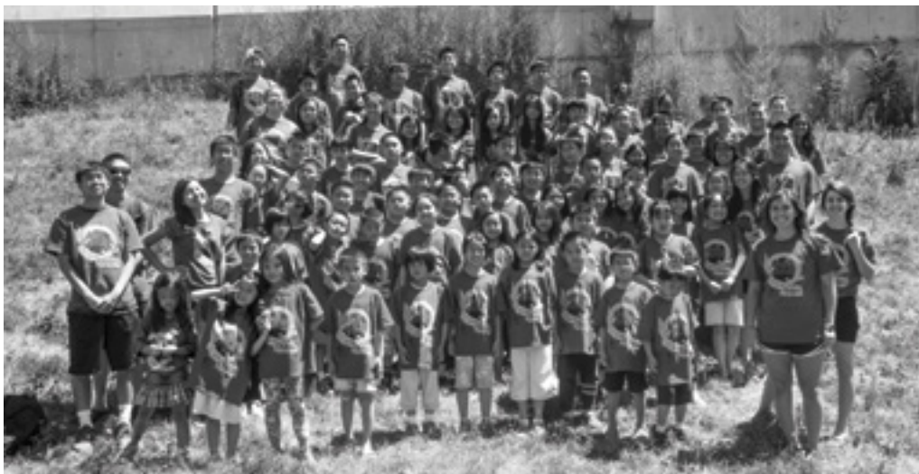
Chinatown Adventure (CHAD)

Chinatown Adventure (CHAD) seeks to enrich quality of life for underprivileged youth in Boston's Chinatown community. It is committed to the academic, social, and personal development of underprivileged youth ages 6-13 in Chinatown. For seven weeks during the summer, each Senior Counselor collaborates with one or two Junior Counselors to mentor and teach a classroom of campers. Senior Counselors and Junior Counselors are encouraged to be creative and are expected to design their own curricula each week. All camp activities are designed to foster academic, social, and personal growth while promoting fun and safety at the same time!