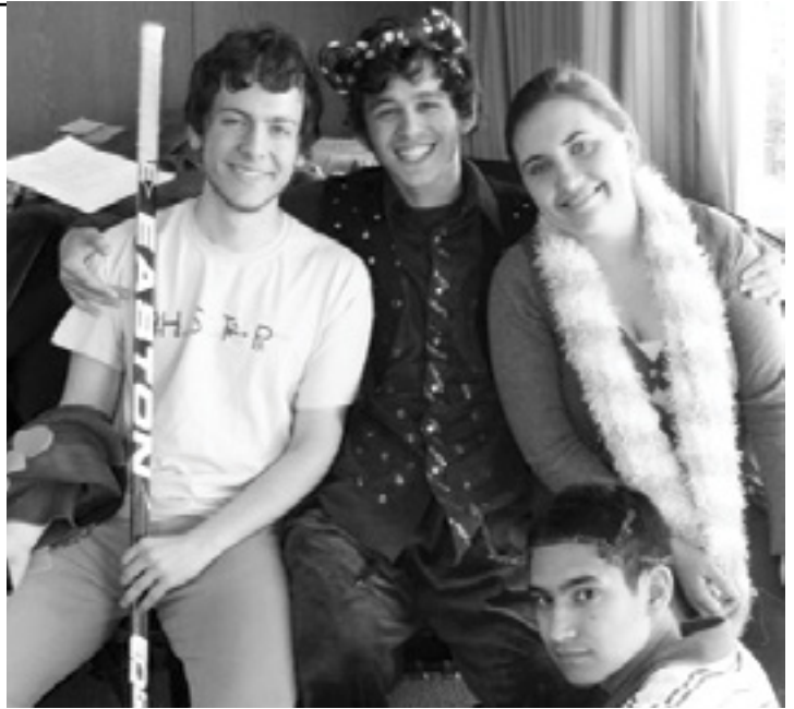
Harvard Story-Time Players

The Harvard Story-Time Players is the only group at Harvard to bring story theater to children in hospitals throughout Boston. The Story-Time Players write, direct, and act in a new play or musical each semester and no prior theater experience is necessary. Harvard Story-Time Players is comprised of dedicated members who have a passion for sharing lots of laughter with children in hospitals through light-hearted, original plays.