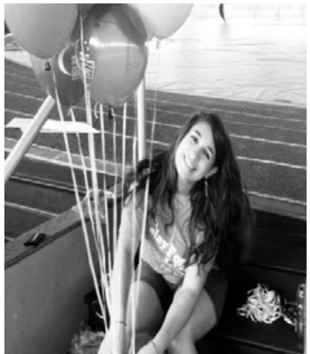
Harvard Cancer Society

Relay for Life: Relay for Life is a fun-filled overnight walkathon that raises money for the American Cancer Society (ACS), celebrates survivorship, and empowers individuals to fight cancer. HCS works with ACS and other Boston-area universities to organize this All-University Relay held at Harvard each April in the fight against cancer.