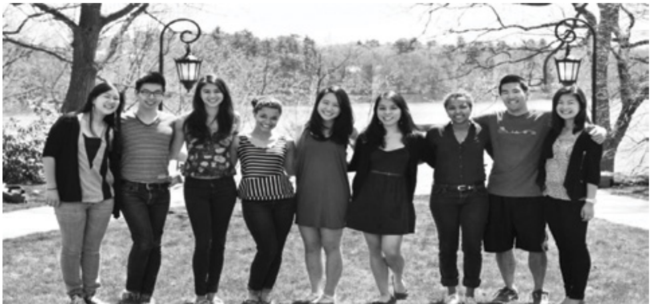
PBHA's Chinatown Afterschool Program

CHANCE (College High-school Alliance: A Nexus for Creative Education) is a college preparatory program which strives to give students from Cambridge's only public high school the desire, support, and motivation to gain admission to college and to succeed there and beyond. CHANCE tutors students from Cambridge Rindge and Latin School, focusing on SAT tutoring, homework help, and college application advising. To meet the needs of all students, our program also runs occasional workshops on the SAT and the college application process. CHANCE holds two sessions every week at Harvard (currently Mondays 3-5pm and 6-8pm), working one-on-one or in small groups.