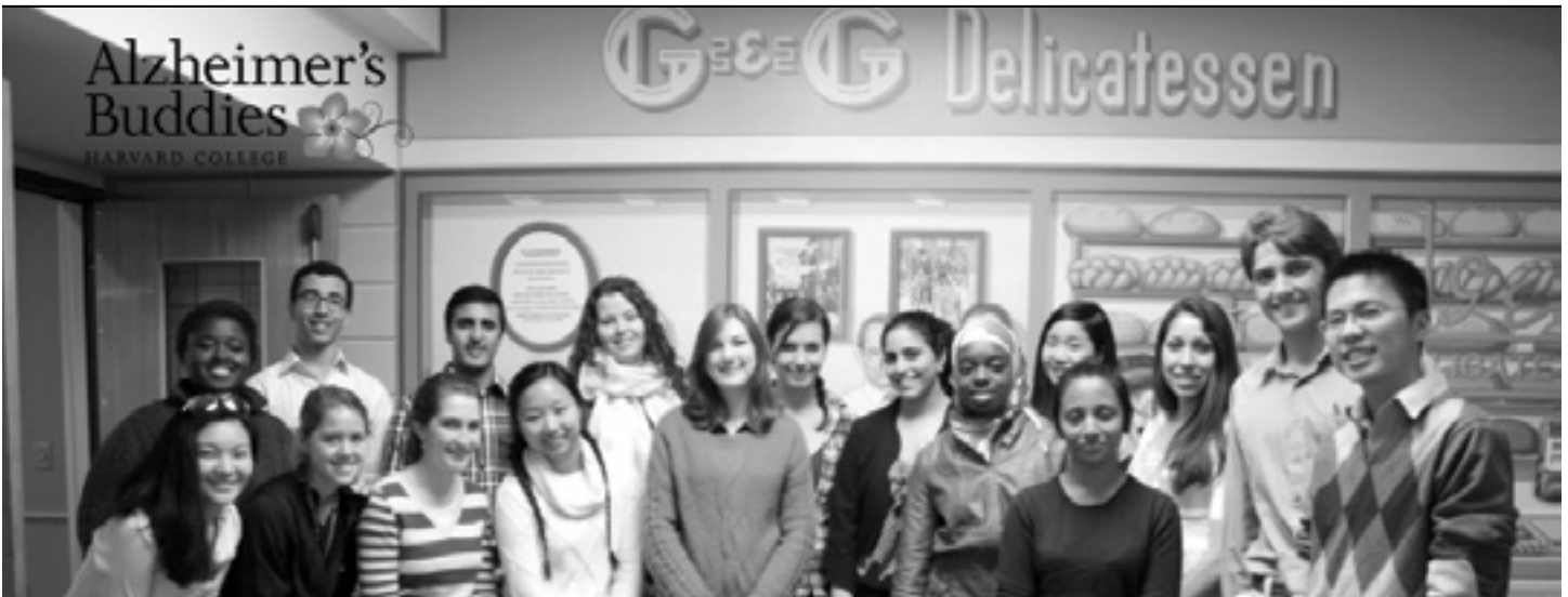
Harvard College Alzheimer's Buddies