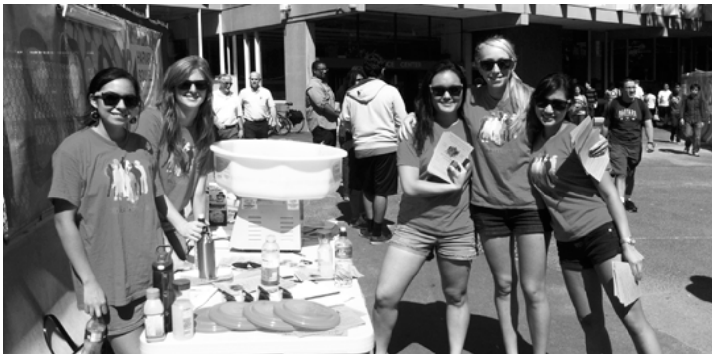
Peer Health Exchange